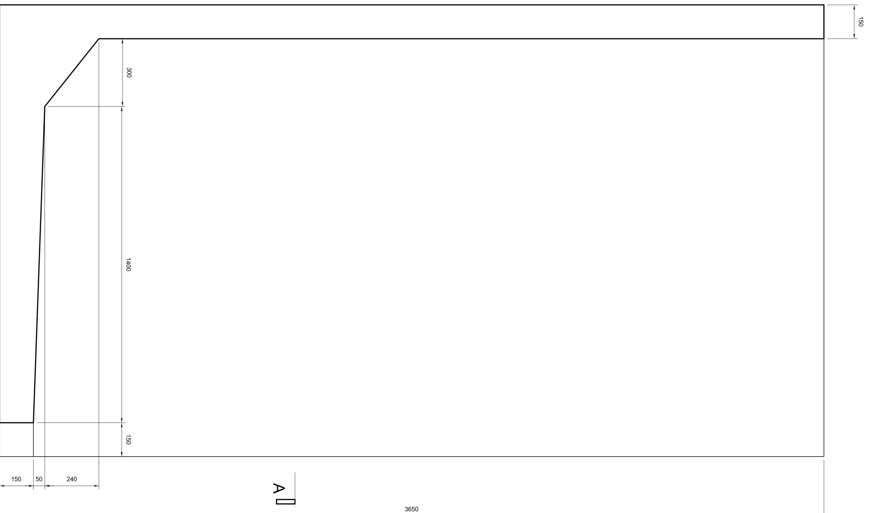
TYPICAL SECTION THROUGH 3650mm CORNER UNIT